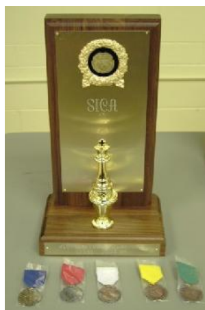
team trophy & individual medals