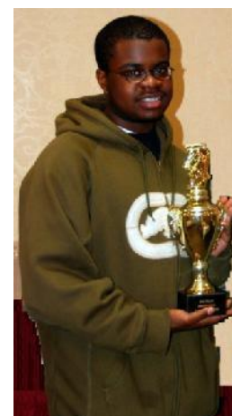
large or small, it's nice to win