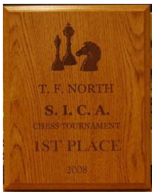
award made in school