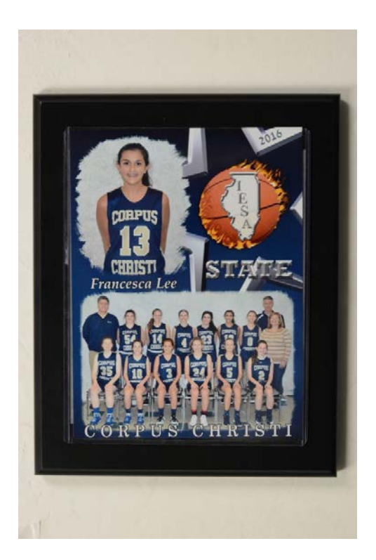
6x8 Team photo mounted on wood Plaque = $30 Quantity ordered _

*Photo plaques will be sold on the day of your first game only *Questions? Email us at info@eventprophotography.net