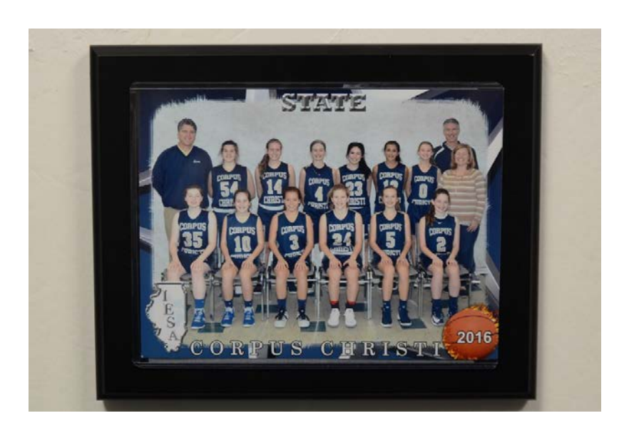
6x8 Team photo mounted on wood Plaque = $30 Quantity ordered _____