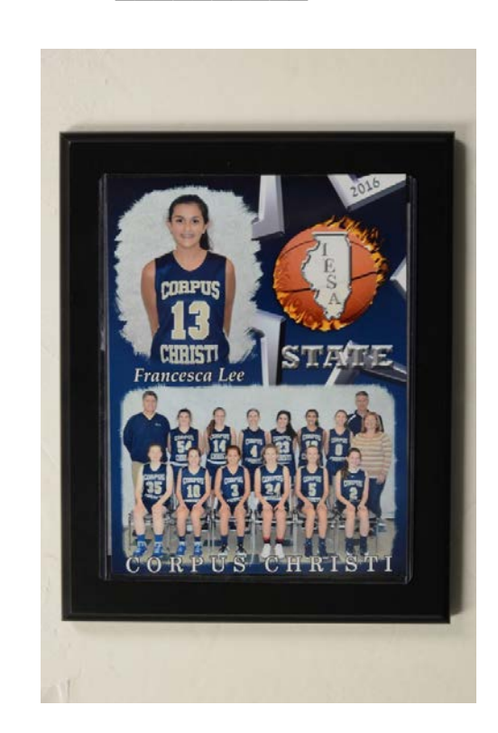
6x8 Individual/Tm photo on wood plaque = $35 Quantity ordered _____