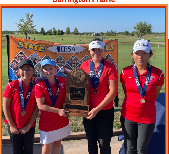
2023 Girls Team Champion Barrington Prairie

HTTPS://WWW.IESA.ORG/ACTIVITIES/CALENDAR.ASP